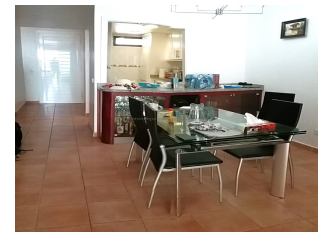
Elegant Apartment with Sea Views in Playa Paraiso

Located in the heart of Playa Paraiso, we present this bright first floor, south-facing apartment, which provides a panoramic view of the sea from its spacious 20m2 terrace.